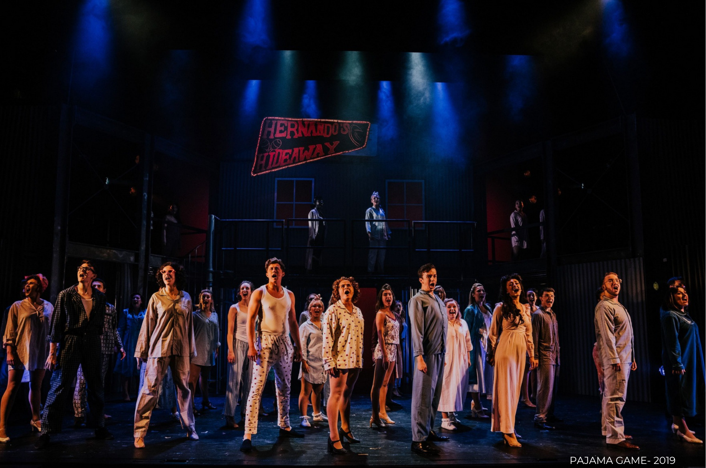
PAJAMA GAME- 2019